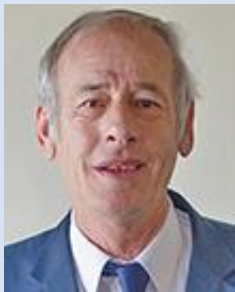
GREG CAPUT Board of Supervisors